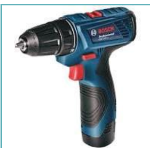
● Hand Drill Machine