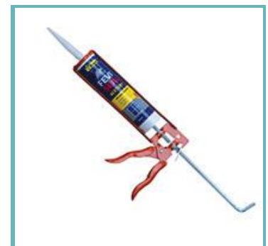
● Sealant for Corners